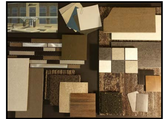
Interior Finish Board