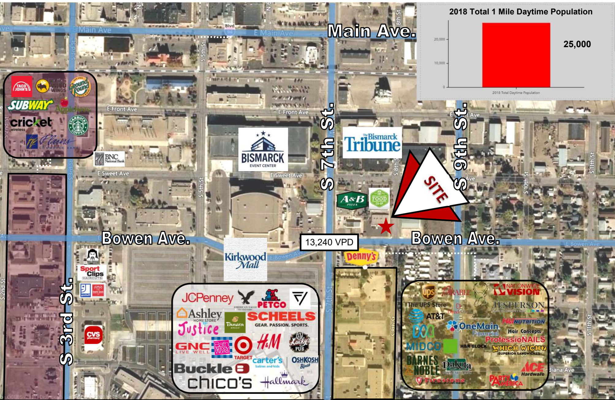
2018 Total 1 Mile Daytime Population