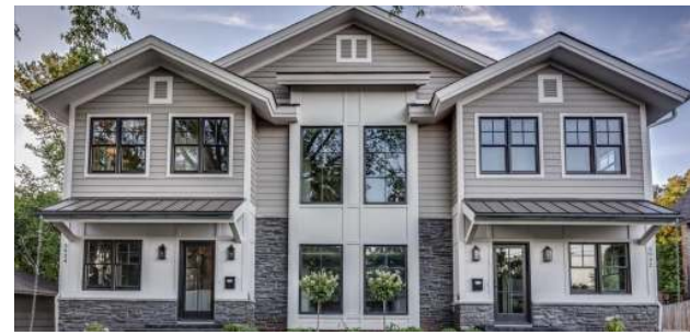
Possible Developments - Images are potential uses